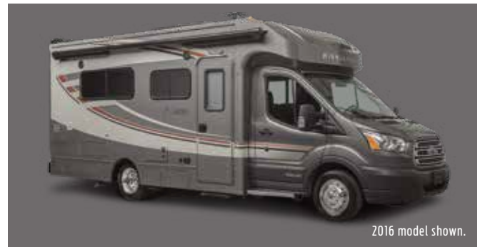
2016 model shown.

M Metric conversion - To obtain information in kilograms, multiply the pounds by .45; to obtain information in kilometers, multiply the miles by 1.6; to obtain information in centimeters, multiply the inches by 2.54.