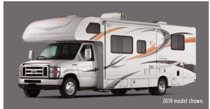
2019 model shown.