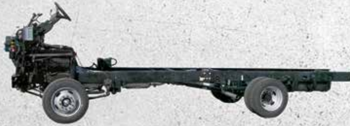
2019 model shown.