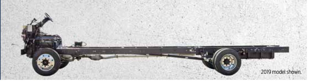
2019 model shown.