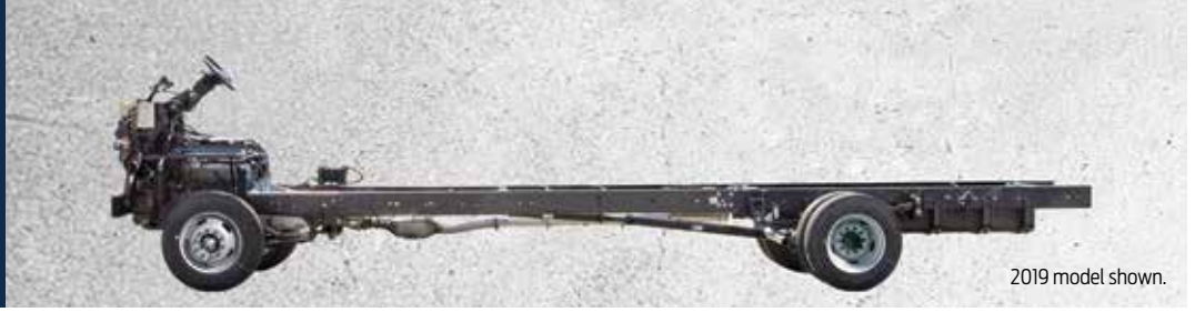
2019 model shown.